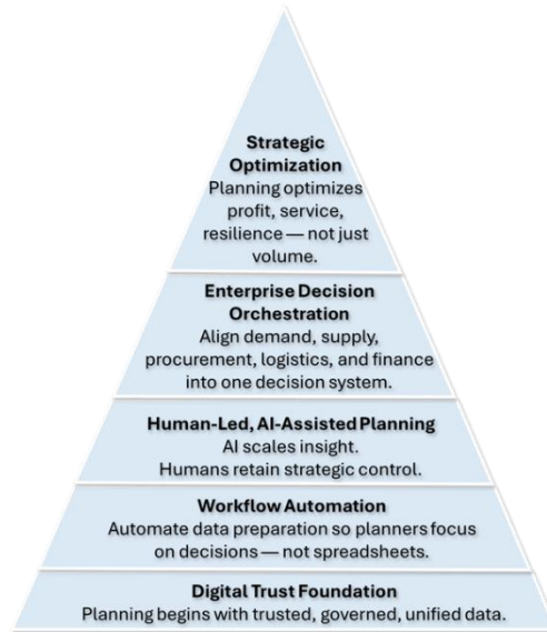
Pic-1: Trinity Planning Framework – Pyramid View